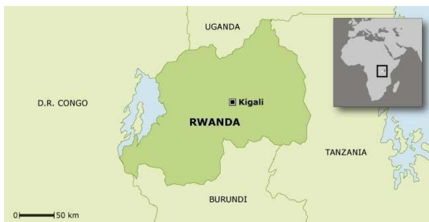
Figure 1: Geographical setting of Rwanda in the regional context

The Republic of Rwanda is a small landlocked country in east central Africa along the Western branch of the Great Rift Valley. The country is bordered by Tanzania (East), Uganda (North), Burundi (South) and the Democratic Republic of Congo (West) (Figure 1). The total area of the country is 26,338 km 2 with a population of 11 million of inhabitants.